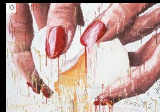
(6) Cat s Cradie, a 2006 photograph; (7) Crystal Swallow, 2006, enamel on metal; (8) the artist in her SoHo studio; (9) Bottle Blonde #3, 2006, enamel on aluminum; and (10) 100 Food Porn #85, 1990, enamel on metal.