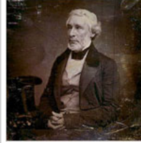
Disunion: Yacht for Sale