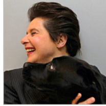
Relishing the Part of a Dog's Best Friend