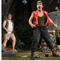
This Blessed Plot, This Trailer, This England