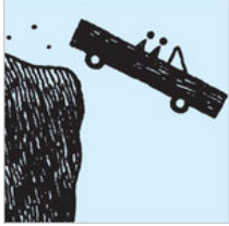
Reconsidering 'Thelma and Louise'