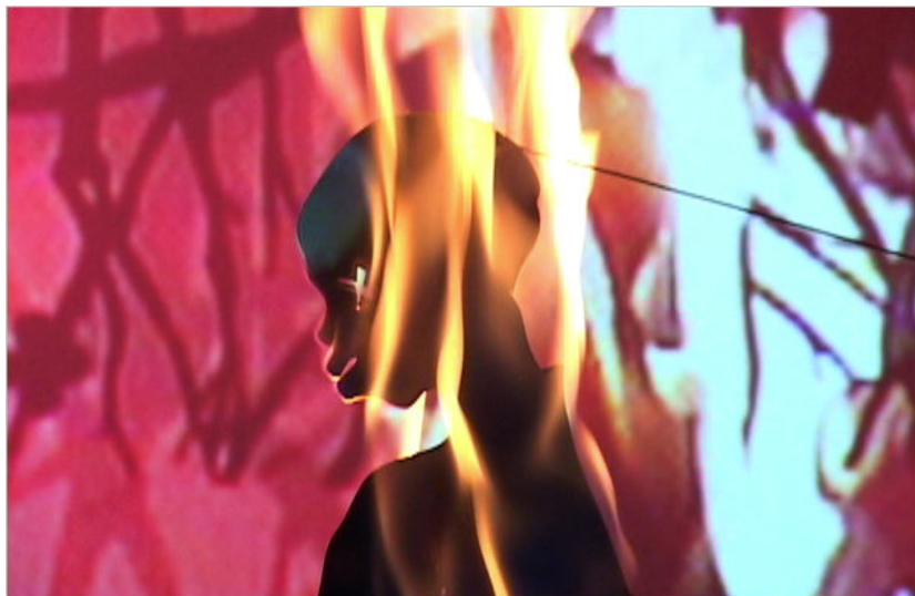
Lehmann Maupin Gallery

A scene from the film "Fall From Grace, Miss Pipi's Blue Tale" by Kara Walker at Lehmann Maupin. The story is told through shadow puppetry.