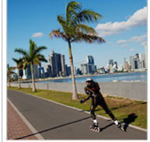
36 Hours in Panama City, Panama

Home | World | U.S. | N.Y. / Region | Business | Technology | Science | Health | Sports | Opinion | Arts | Style | Travel | Jobs | Real Estate | Autos | Site Map © 2011 The New York Times Company | Privacy | Your Ad Choices | Terms of Service | Terms of Sale | Corrections | RSS | Help | Contact Us | Work for Us | Advertise