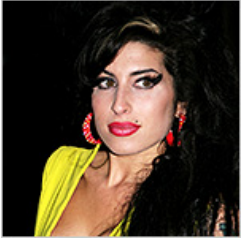
A Bad Girl With a Touch of Genius