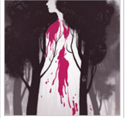
Over the Verrazano, Into the Shadows

Home | World | U.S. | N.Y. / Region | Business | Technology | Science | Health | Sports | Opinion | Arts | Style | Travel | Jobs | Real Estate | Autos | Site Map