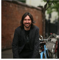
Rock Chronicle Inspires Battle Over Its Legacy