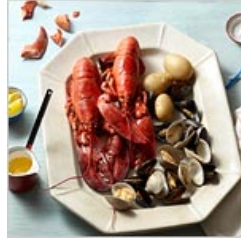
Let's Have a Real Nice Clambake