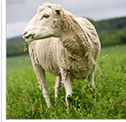
Permaculture Emerges From the Underground

Portraying political positions as religious convictions is an obstacle to meaningful debate.