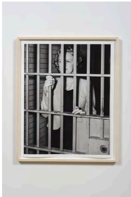
Amy Bessone, Number 8: Joan (2015). Archival pigment print, 41.5 x 33.5, Edition of 2, 1 AP. Courtesy of the artist and GAVLAK Los Angeles. Photo: Jeff McLane.