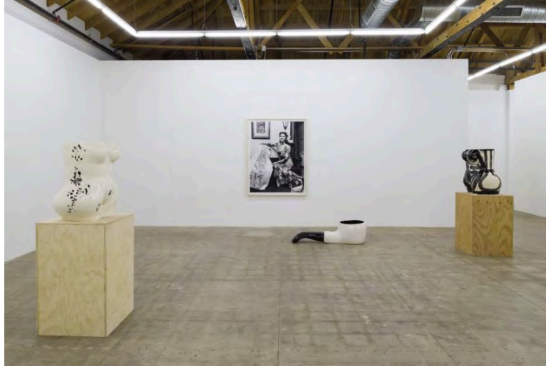
Amy Bessone, In the Century of Women (installation view) (2015).

Contemporary Art Review LA, January 13, 2016