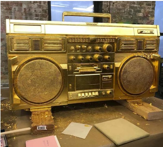
Like his 24K golden Conion Boombox...