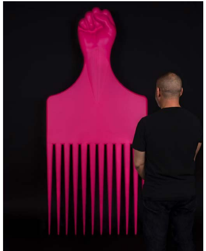
And his three-part 2016 Afrocomb installation which was inspired by The Free People of Color. The Afrocomb was worn in the hair not only as an adornment but also as a political emblem and a signature of a collective identity.