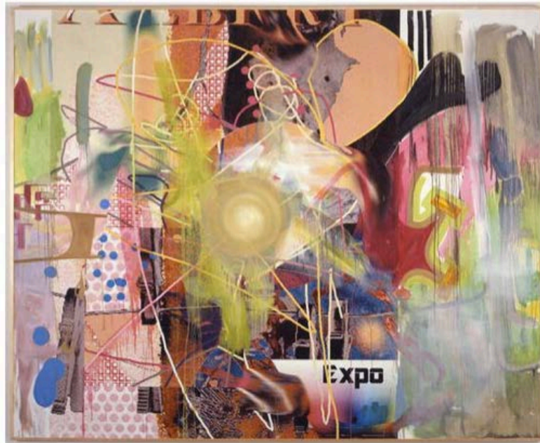
Albert Oehlen, 'Deathknocko', 2001.