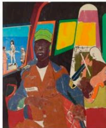
R.B.Kitaj, 'Juan de la Cruz', 1967. Kitaj compares the church reformer St John of the Cross to an American sergeant at the time of protests against the Vietnam war.