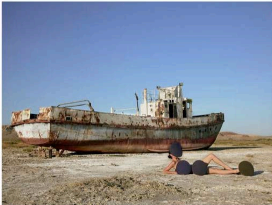
Almagul Menlibaeva, 'The Aral Beach no.2', 2011. Duratans print.

Safe to say, expect not an overall aesthetic from this under-represented region of Central Asia, but instead a visual array that touches upon modernist figuration, landscape photography, readymade sculpture and rough-and-ready abstraction.