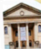
The Zabludowicz Collector's London gallery in Chalk Farm

For most parties, it's an old Methodist chapel revamped by the Zabludowicz into a testing lab for emerging art in London. A lucky few may get to visit the couple's home and see Jeff Koons's work in their kids' room - redefining 'living with art'.