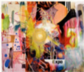
DEATHORNOCH (2011) BY ALBERT OEHLER

Chaotic collisions of colour contrast! Agitated effect! Interrupted images! Albert Oehler's 'post-non-representational' art comes to Chalk Farm.