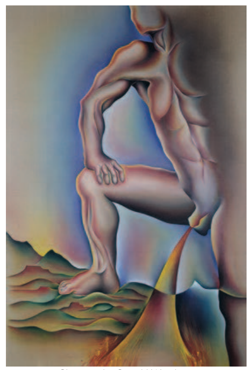
PISSING ON NATURE, FROM POWERPLAY, 1984; SPRAYED ACRYLIC AND OIL ON BELGIAN LINEN; 108 . 72"

STEINEM: [ laughs ] It had the familiarity of your home and place of birth and growing up and current living, so there was a circular impact—not just the linear impact that a canvas or a sculpture has. It had a profound impact on me.