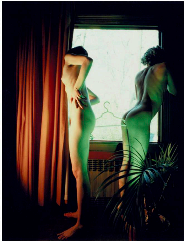
Coat Hanger, 1980