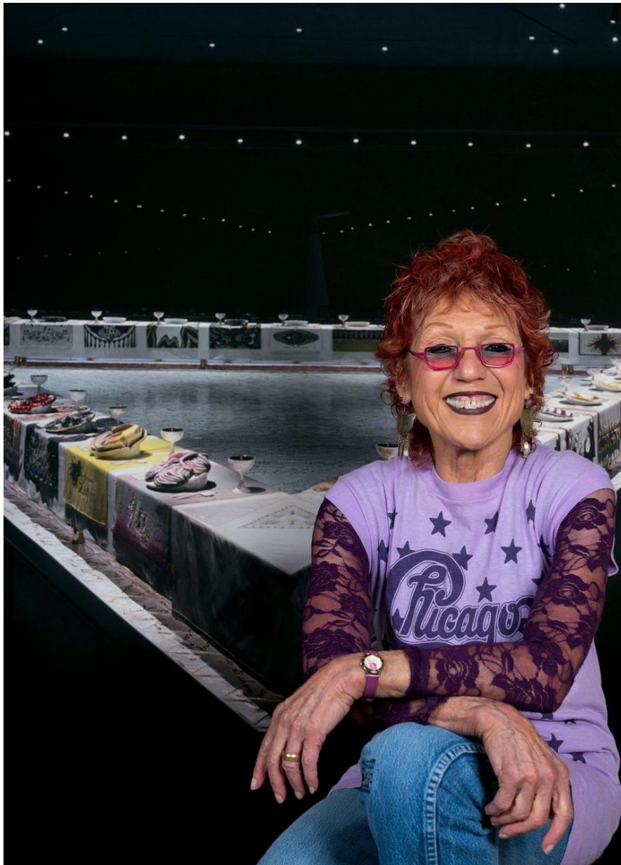
Judy Chicago photographed with her seminal work, The Dinner Party, now permanently housed at the Brooklyn Museum.