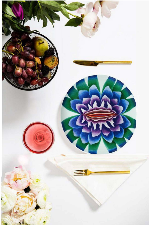
Sappho Place Setting from Prospect ($135) PROSPECT NEW YORK

"=fjYhfjYXlc Xc h |gZcf mUfgUbXmUfg"=hi gXlc fYU`nZi gfUY'a Yh Uh a i gYi a `g\cdgzh YU XjYbWZcf k\ |W|ga cg`inkca Ybzk YfYbchWffn|b| ZYa |b|ghUfhdfcXi Wg" Gczk \ Yb`g\ YkUgUddfcUWYXVn@u fU7i ffjYZZci bXf`cZ DfcgdWZ`UbXUa ]`YbbjUz`7\ |W|c bchYgZ\ YZci bXgca Yh |b| `cZU_|bXfYX gdlf|h|b h Uz`_Y\ YfZ7i ffjYkUg`cd|h| |c`[ c Ufci bXlfUX|h|cbU`a i gYi a Xjgf|M hcb` VnigY`|b| |hYa gcb`|bYZXjYWlhc Wbg a Yfg'