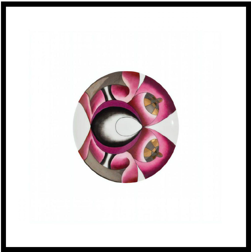
Primordial Goddess plate ($135 at Prospect) symbolizing the universal female principle. PROSPECT NEW YORK

BUa YXcbYcZH Ha Ya U Uj|bYg 322 A cgh Zi YbhU D Xcd YcZ h YMUf fl23: IZ7\|W| c'a U|b|U|bg'UZ ``fcg|f'cZdfc^W|g|UbXi g|g^ Yf'dU|Zfa lc Wbh|bi Yh YWbj YfgU|cbg|g\ YV| U|b|h Y3; 92gUgUb'ci hgc|_Yb U|j cW|Y|Zcf kca Ybfg|c|Wg|b Ufh|bXZcf|[fYU|f'UW|gg|lc Uf| V|mbXh YkU`gcZ |bg|li |hcbg|" K |h h Yi dWa |b| 'cdYb|b| 'cZUW|ckX| bXXWa a i b|lm|fhgdUW |b\ Yf'WffYbh\ca YcZ6Y|bzB Yk 'A Y| |W|f| |m|23; IZUbXh YfYWbh^U bWcZ Ub Y| W g|j YdfcXi W|b|Yk |h DfcdYWZ 7\|W| c'g|U|gZ"=fa Xc|b| k\U|f|Y Uk U|g|XcbYZ=fa [c|b| U|ci bX|fU| |hcbU X|gf|V| |hcb'g|g|Ya g"