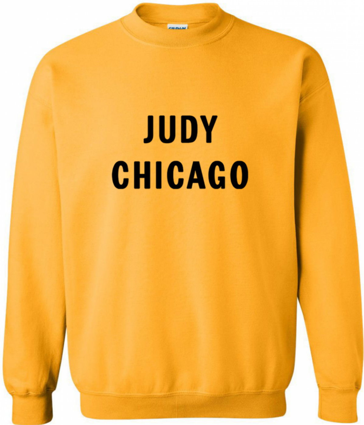
Judy Chicago sweatshirt and homage to the artist [see photograph below.] Freeing herself of any male-dominated nomenclature, Judy Gerowitz officially transformed into Judy Chicago in 1970. ($95 at Prospect) PROSPECT NEW YORK