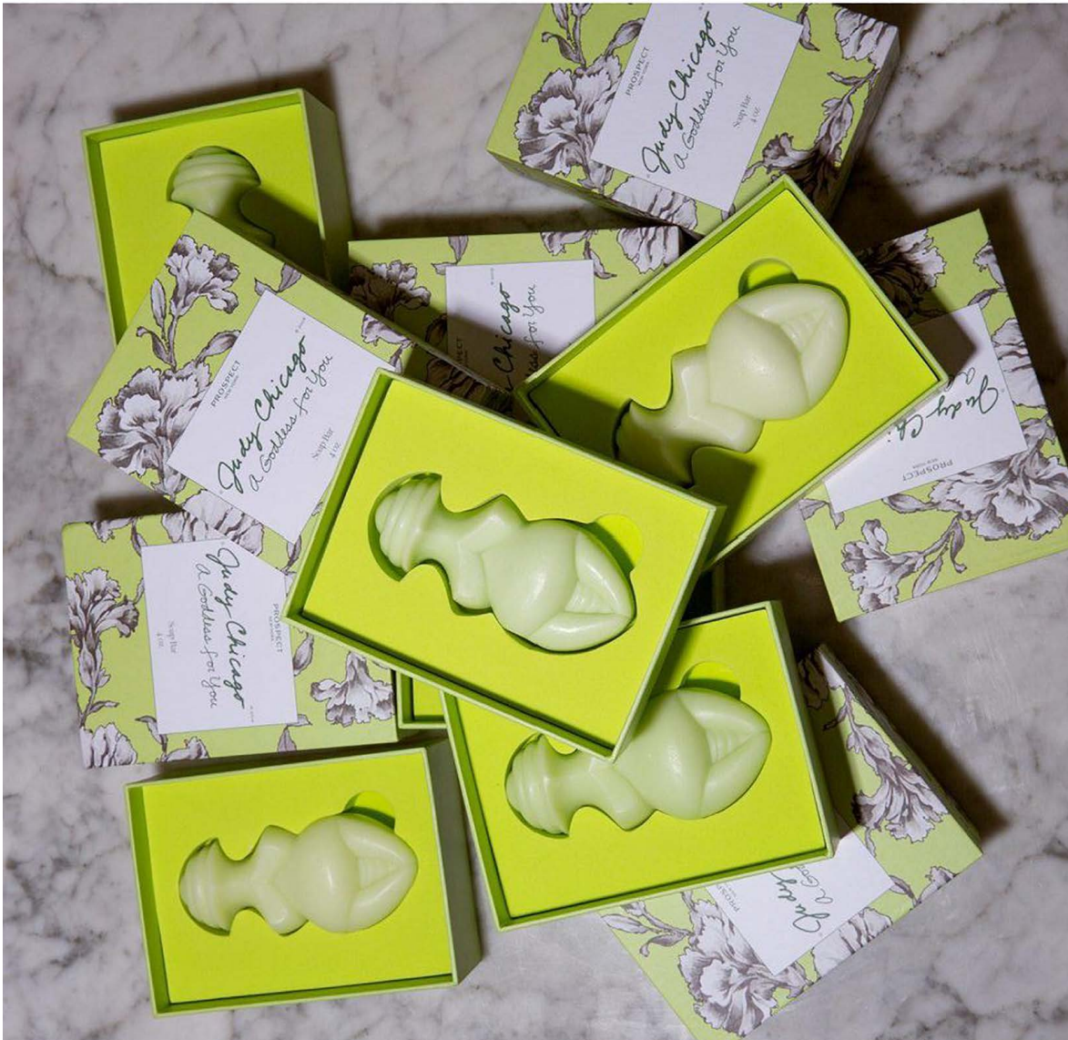
A Goddess For You: Spring Soap Sculpture available at Prospect ($25). In this limited-edition collaboration, Chicago reinterprets the Venus de Willendorf, an early figurine of the mother goddess (c. 30,000 BCE). PROSPECT NEW YORK

Za ]b]ghUfzVi h7\ ]M] c ]gei ]W]t' dc]bhci hh Uh] Y]bgU`U]cb Y] Ybi U`m h.f]j YXVW] gYcZ` [ fUgfcchgYzcf]gZca UHfbU]j Y[ fci dg` fU] Yf`h Ub Xi Y]c Ubngk ]Zi]bg]li h]cbU` gYUWUb[ Y`-b ZWZ]hk Ug]cb`nU]f`7\ ]M] c Zi bXX\ Yf bcb!dfcZ]zH fci [ \ h Y: `ck Yfz]c UWW]hU[ `cVU`ci h]ci f]b[ `cZa cbY]fm XcbU]cbgZ]h]a YgU]ga U` Ug` 7Z` 32Z` 37` h U]g\ Yk UgUVY]c Yg]U]g\ h Y Z]bUb]U` VUW]b[ UbXW]a a i b]m]g] ddcf]h]c Y\ ]M]h] Ykcf`"