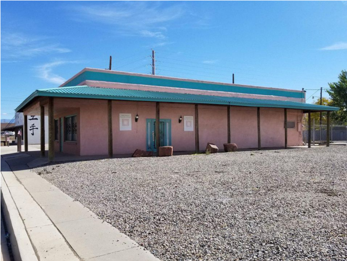
Exterior of Through the Flower Art Space in Belen, New Mexico

After spending many years fighting to open her own professional doors—"the biggest compliment you could get was that you painted like a man"—Chicago is gHUXZgh]b`YfWa a ]ha Ybhc`g ddcfh]b[ kca Ybfgj c]Wgž]b`Yd]b[ h YXccf cdYb Zf`ch Yf`kca Yb UfhgžUbX` UgXX]WHX` Yf`bcb!dfcZlžH fci [ \ h Y : `ckYfžlc`U bW]b[ ZÁ ]b]ghUfhY \ ]M]hcbgUgkY` UgXYj Ycd]b[ YXi W]hcbU Wff]W/i a`UbX`cg]b[ fY[i`Uf`Wm fYgUbXWa a i b]lm] Yblg"G\ YUbX` Yf \i gYubXžd\ch[ fUd`Yf 8cbUXK ccXa Ubž`Uj YUgc`Ya VUf`YXcb`h fb]b[ Ub UUbXcbYXVi ]`X]b[ ]b`6Y`YbžB Yk`A Yl ]Wžh Yf`ca YZcf`h YdUg48`nYUgž]blc H fci [ \ h Y: `ckYf`5fhGdUWžUWa a i b]lm]fhUbXYl \ ]M]hcb Wbhf"Df\ Udg i bg fdf]gb[`nž7\ ]W] cfg]b]h]U`d`UbgZcf`h YUfhgdUWk YfY`dfyj YbHXZfca a cj ]b[ ZcfkUfX]b`h YdfcdcgYXdUfbYfg`]d`k]h`h YV]m]m]Uga U`žVi hj cWž [ fci d`UbXgcžcbWU] Ubžg`YUbX` Yf`hUa`h fbYXlc`[ fUggf cclgWckXl bX]b[ hc`fUgYa cbYmZcf`h Ydfc`Wm]UbX` Uj YfYW]j YX`Ub`ci hci f]b[ `cZWá a i b]lm g ddcflž`UWfX]b[ hc`K ccXa Ub"