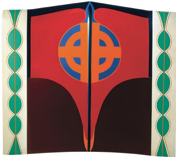
Car Hood (1964), Judy Chicago, Moderna Museet, Stockholm. Photo: © Donald Woodman/ARS, NY; © Judy Chicago/Artists Rights Society (ARS), New York

The Dinner Party (1974–79) remains the work for which Chicago is best known. A stupendously ambitious installation based on the conceit of an imaginary convocation of great women, The Dinner Party consists of a triangular table, set for 39 guests. Each place-setting includes a painted ceramic plate, a chalice, a napkin, a knife, fork and spoon, and an embroidered runner commemorating one of the mythical, fictional or historical figures summoned to the banquet. Sappho, Artemisia Gentileschi and Georgia O’Keeffe are among the better-known guests; many others, such as the 11th-century physician Trotula de Ruggerio, have been largely forgotten. (An early incarnation of the project was provisionally titled Twenty-five Women Who Were Eaten Alive .) During the five years of its creation, more than 400 volunteers, mostly women, collaborated with Chicago on the project at her studio in Santa Monica. Painters, needleworkers, ceramicists and historical researchers lent their skills, rewarded only by a shared sense of purpose and community, group discussions and potluck dinners.