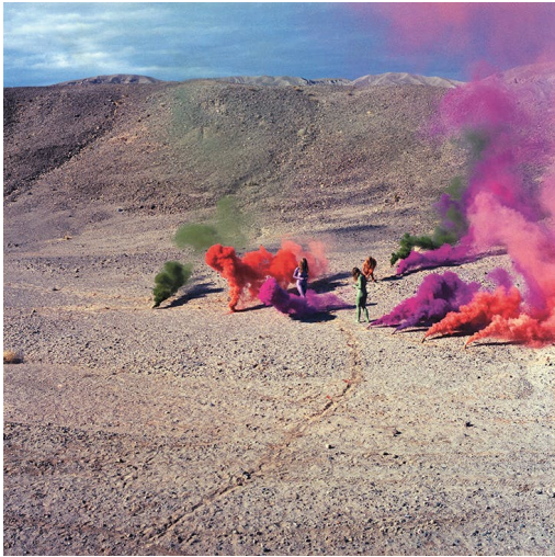
Smoke Bodies from 'Women and Smoke', photograph documenting performance in the California desert, (1972), Judy Chicago.

In January 1972 it opened as Womanhouse, a seminal example of a collaborative, immersive art environment. Participants, including Chicago and Schapiro themselves, created their own installations in rooms and cupboards throughout the house, and staged performances such as Chicago's play Cock and Cunt . The intense audience and media response, as she later wrote in her second autobiography, Beyond the Flower (1996), contributed to 'what I always knew would happen, which was that I was becoming famous'. A review in Time magazine – the first exposure that many of its readers would have had to feminist art – estimated that some 4,000 visitors filed through Womanhouse's front door on its opening day.