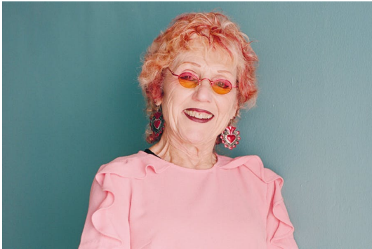
Judy Chicago photographed in Santa Monica in September 2018.

Judy Chicago is excited. ‘This morning my Instagram completely exploded!’ she tells me, clutching her iPhone, when we meet at her Santa Monica hotel. It is late September 2018, the day after Christine Blasey Ford’s devastating testimony, and Brett Kavanaugh’s subsequent tantrum, during the Senate Judiciary Committee confirmation hearings. A friend has forwarded Chicago an article on the website Bustle headlined ‘The Whole Country Just Watched What Happens When Angry, Powerful Men Don’t Get Their Way’, in which the faces of Kavanaugh, Lindsey Graham and Chuck Grassley were shown as a triptych, contorted in what the writer described as ‘fury and condescension’.