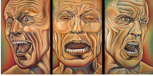
Three Faces of Man from 'Power Play' (1985), Judy Chicago, Palmer Museum of Art, Penn State University, Pennsylvania

'I came up just like everybody else,' she says, 'into the small LA art community, with this idea that there was a small audience for contemporary art. Then when The Dinner Party became the piece that everybody wanted to see, and nobody wanted to show, and people started organising around the world to get The Dinner Party to their town, and it went on this huge alternative tour to 16 venues, six countries, three continents, to a viewing audience of over a million people, that kind of exploded this myth about the small audience for contemporary art! It educated me to the potential power of art. There was no going back from that!'