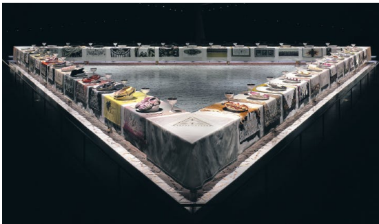
The Dinner Party (1974-79), Judy Chicago, Brooklyn Museum of Art, New York. Photo: Donald Woodman/ARS, NY; © Judy Chicago/Artist Rights Society (ARS), New York

Not all sectors of the art world were enthusiastic. Reviews were decidedly mixed, and the work's planned tour to the Memorial Art Gallery in Rochester and the Seattle Art Museum was cancelled, in the latter instance after the curator publicly stated that 'I do not consider it fine art, but an interesting project by a group of women of whom the leader was an artist. I saw it more as a political statement than art.' Perhaps the expressively painted vulvas on each of the plates – what Chicago catchily refers to as her 'vagina china' – were too much for certain delicate (male) eyes. Instead, grass-roots organisations began to come forward, offering to exhibit the work – an expensive and complicated undertaking. Over the next eight years it reached audiences all around the world. Then it languished, dismissed by many as politically anachronistic, essentialist about female identity, oblivious to non-white women, even aesthetically dubious. 'Everybody tried to pretend it never happened, it wasn't important, it was passé, feminism was passé, I was passé!' says Chicago, adding, 'Like, you wish!' In 2007, after the work had been in storage for years, The Elizabeth A. Sackler Center for Feminist Art opened at the Brooklyn Museum with The Dinner Party as its permanent centrepiece.