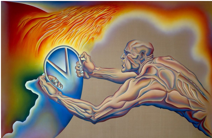
Judy Chicago, Driving the World to Destruction from Powerplay , 1985. © Judy Chicago / Artists Rights Society (ARS) New York.

For the most part, the public rewards artists who get good at one thing and stick to it. The name Georgia O'Keeffe instantly conjures paintings of flowers and desert landscapes. Mark Rothko brings heavy, colored squares to mind. On the other side of the spectrum are artists who make huge stylistic leaps throughout their careers. For example, Philip Guston: After working for decades in gestural abstraction, he began painting cartoonish figuration that critics initially despised. Humans like to categorize; it's easier to consider an artist's singular aesthetic than it is to wrestle with a sprawling body of work.