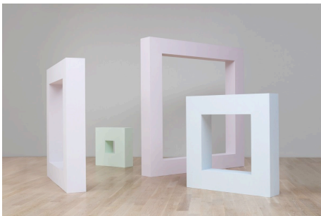
Judy Chicago, Sunset Squares , 1965. © Judy Chicago / Artists Rights Society (ARS) New York. Photo by Fredrik Nilsen Studio. Courtesy of the artist and Salon 94, New York.

The survey starts with two Minimalist sculptures from the 1960s. Sunset Squares (1965/2018) comprises four standing square frames, canvas-covered plywood painted in pastel hues. Trinity (1965) consists of three upside-down V-shaped forms (latex paint on canvas-covered plywood) in red, orange, and yellow. Jewish Museum curator Kynaston McShine included one of Chicago’s works from this era in his groundbreaking 1966 show “Primary Structures”—she was one of only three featured women, along with Anne Truitt and Tina Matkovic Spiro. The exhibition established a roster of the day’s most important Minimalist sculptors. Alongside works by Donald Judd, John McCracken, and Carl Andre, Chicago’s sculpture placed her at the forefront of a burgeoning movement.