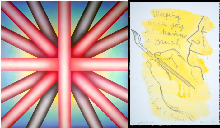
Judy Chicago, Heaven is for White Men Only , 1973. © Judy Chicago / Artists Rights Society (ARS) New York. Collection of the New Orleans Museum of Art.