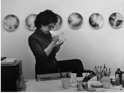
Judy Chicago in “The Dinner Party” China Painting Studio, 1975 Brooklyn Museum

Yet it’s not fair to say that Chicago hasn’t already received significant recognition. Her iconic 1974–79 installation The Dinner Party was a hit when it debuted at the San Francisco Museum of Modern Art in 1979. Over the next nine years, the piece toured the U.S., Canada, Scotland, and Germany (it’s now on permanent view at the Brooklyn Museum). The Dinner Party consists of banquet tables arranged in a triangle, lined with place settings for 39 of the most famous women throughout history and mythology: Sojourner Truth, Sappho, Eleanor of Aquitaine, Sacajawea, Virginia Woolf. Each guest gets her own goblet and individual plate, which all suggest female reproductive organs. In all, the artwork is a potent celebration of female leadership, communion, and sexuality. The ICA Miami survey includes test plates affiliated with the series, but ensures that they’re not the show’s centerpiece: The curators have situated them off to the side.