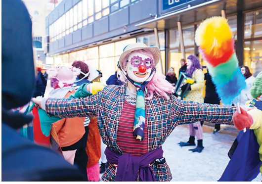
Member of Loldiers of Odin protesting Finland's immigration policy, Tampere, Finland, January 23, 2016.