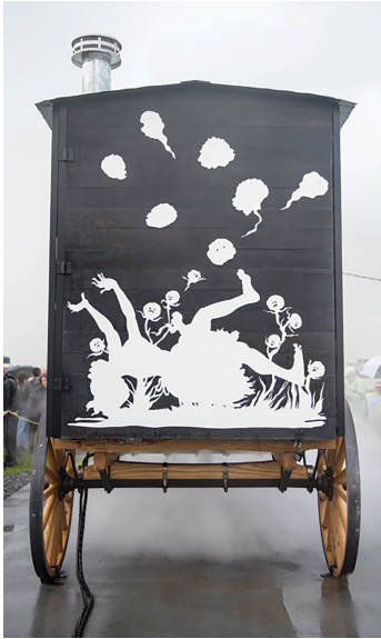
Kara Walker, The Katastwóf Karavan, 2018, mixed media. Installation view, Algiers Point, New Orleans. From Prospect.4.

The Katastwóf Karavan combines Kara Walker's brilliant visual work with a cacophonous soundscape by composer and artist Jason Moran. The work merges her signature silhouetted figures with a calliope. Their arresting piece debuted in New Orleans for Prospect.4. Sadly, there is little good video documentation of the work, but do the research—it's worth it.