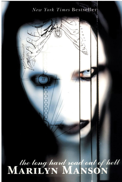
Cover of Marilyn Manson's The Long Hard Road Out of Hell (HarperCollins, 1998). Written with Neil Strauss.