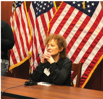
Nan Goldin at a press conference for the Comprehensive Addiction Resources Emergency Act, Washington, DC, April 26, 2018.

And sometimes addiction spurs action. If you've read anything about the opioid epidemic, you immediately see that it could have been totally avoided. In the early 2000s, the US Department of Justice wanted to indict three major executives at Purdue Pharma for hiding information about the drug OxyContin's addictive properties—but certain officials in the DOJ at that time, under George W. Bush's presidency, did not support it. Since debuting her scathing project in the January 2018 issue of this magazine, Nan Goldin has been vocal about holding the Sackler family (major arts patrons who own Purdue Pharma) and their company accountable for distributing their version of synthetic heroin. She is a powerful example of an artist getting political.