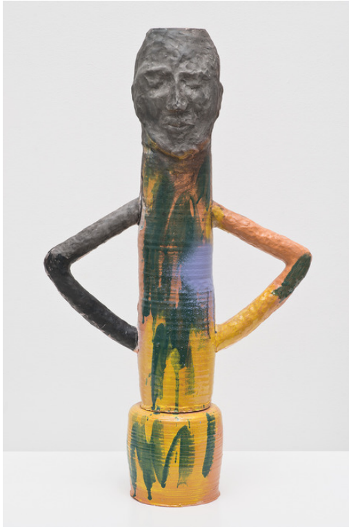
Ruby Neri, Untitled , 2012, ceramic, glaze, spray paint and ink, 31 1/4 x 17 3/4 x 6 1/2 inches (79.4 x 45.1 x 16.5 cm); Photography: Brian Forrest / Courtesy of David Kordansky Gallery, Los Angeles, CA

SB: While sitting on the panel for the Clay in L.A. Symposium you described your sculptures as your "little army". Who are the figures in your work and what is your relationship to them?