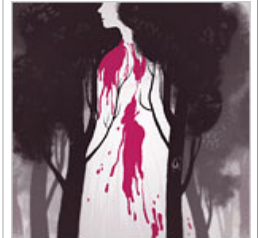
Over the Verrazano, Into the Shadows

Home | World | U.S. | N.Y. / Region | Business | Technology | Science | Health | Sports | Opinion | Arts | Style | Travel | Jobs | Real Estate | Autos | Site Map