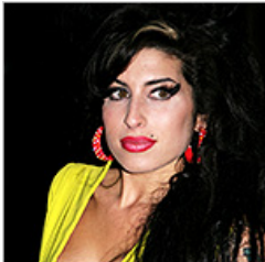
A Bad Girl With a Touch of Genius