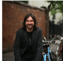
Rock Chronicle Inspires Battle Over Its Legacy