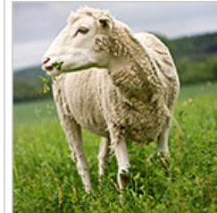
Permaculture Emerges From the Underground