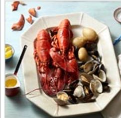
Let's Have a Real Nice Clambake